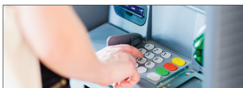
Office Equipment, Medical Devices, ATM, Vending Machines