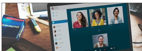
5G Networking/Telecommunications Communication Modules (WiFi Routers and Mesh Devices)